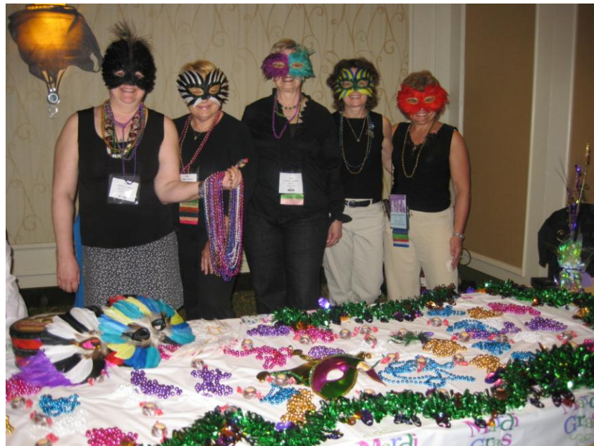
Component Night – OPANA table